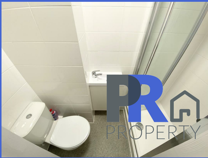
61 Conway Close, Houghton Regis, Dunstable, Bedfordshire, LU5 5SB £725 PCM